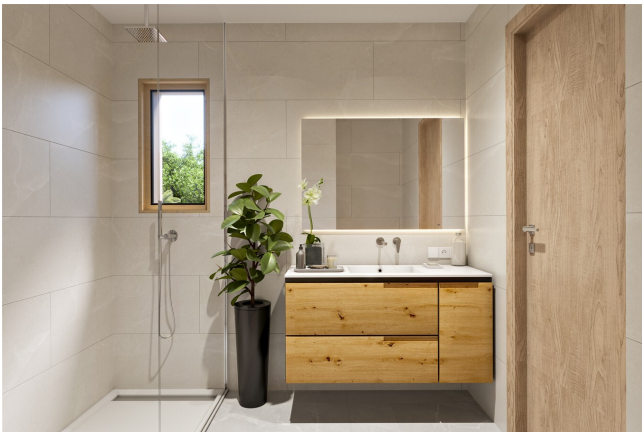
kaufen Haus Artá