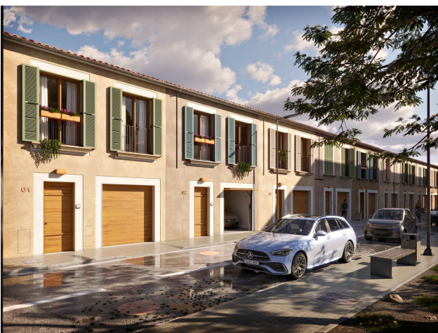
Neubau Haus Mallorca