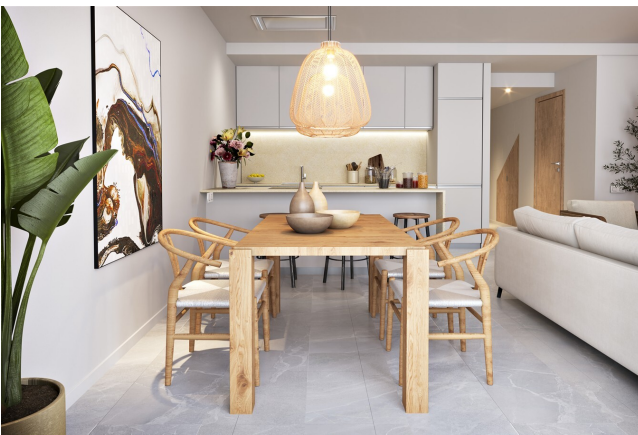
Neubau kaufen Mallorca