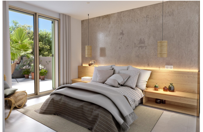
fors sale new build