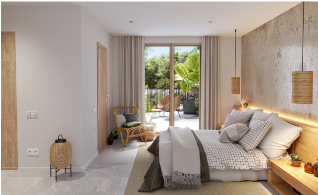
for sale house Majorca