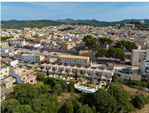
Neubau Artá Mallorca