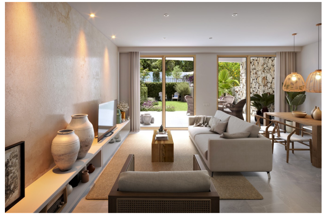
Haus Kauf Mallorca