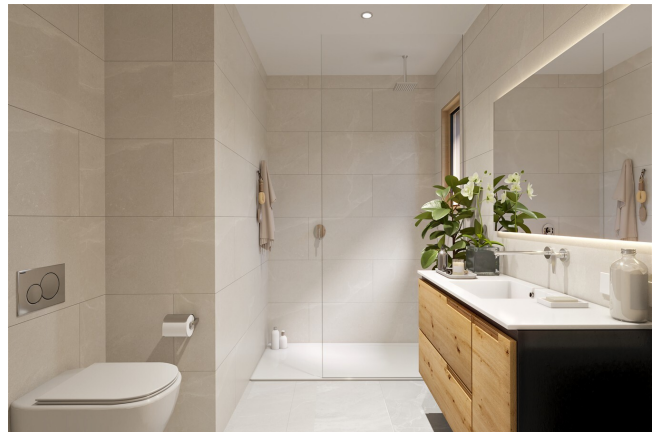
Artá Haus kaufen