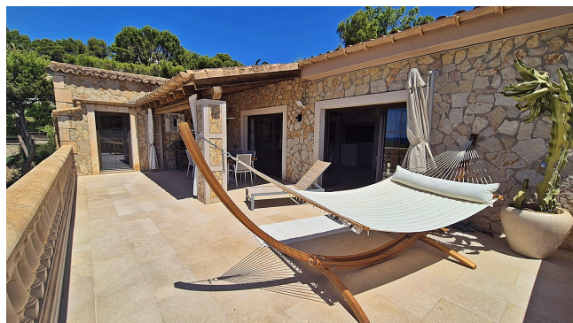
kaufen Viola Mallorca