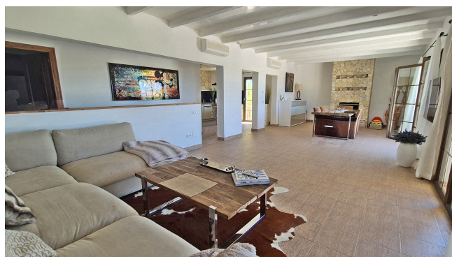
Mediterrane Villa kaufen