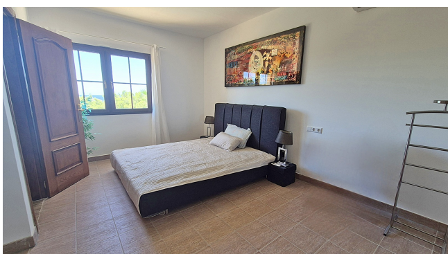
sea view mallorca