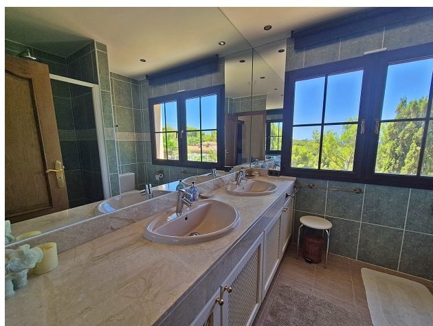
sea view properties