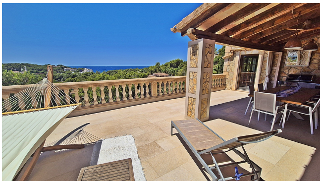
Villa Meerblick Mallorca