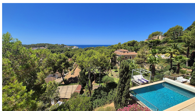
Meerblick kauen Mallorca