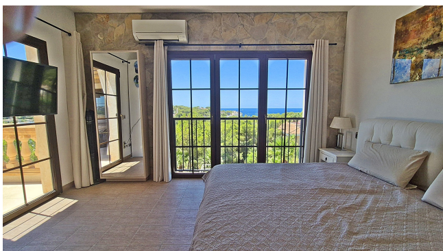
for sale sea view property