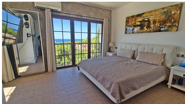
Villa sea view Mallorca