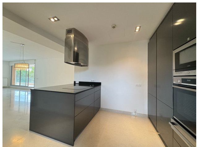
sea view penthouse