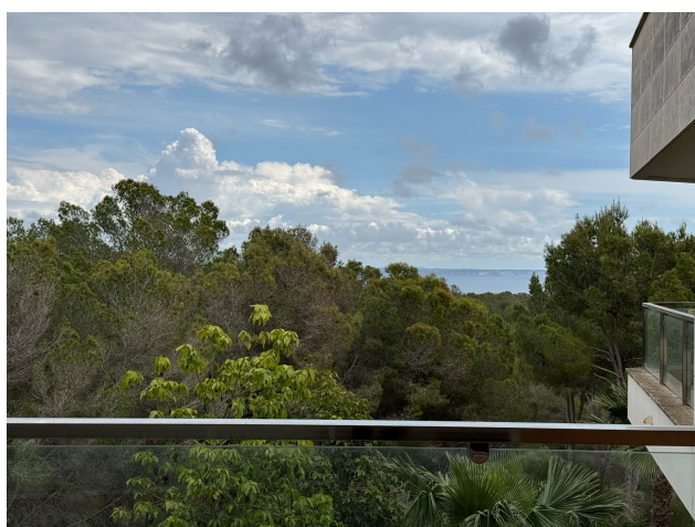
for sale penthouse