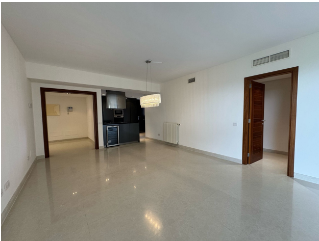
Penthouse Sol de Mallorca