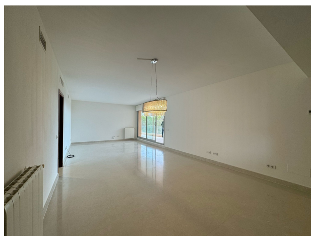
penthouse for sale