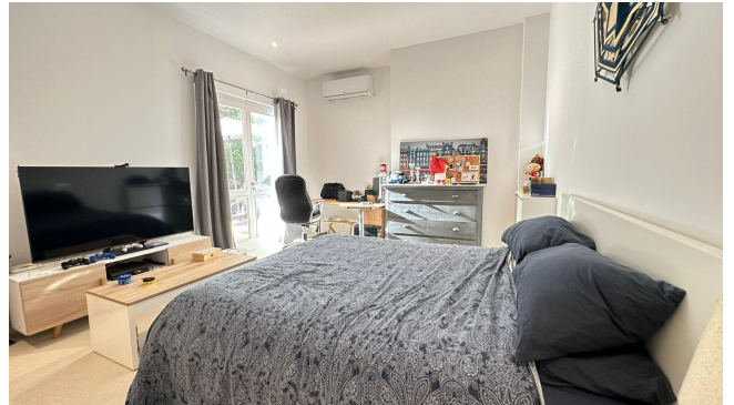
for sale Majorca