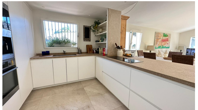
for sale Mallorca