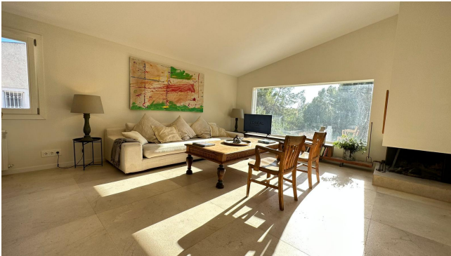
Costa de la Calma Villa