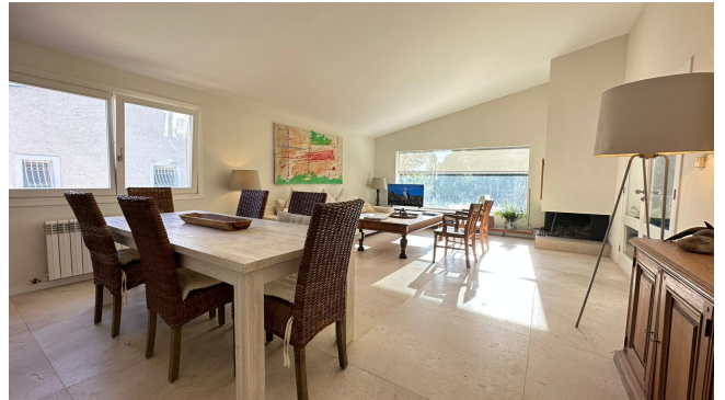
Villa modern kaufen