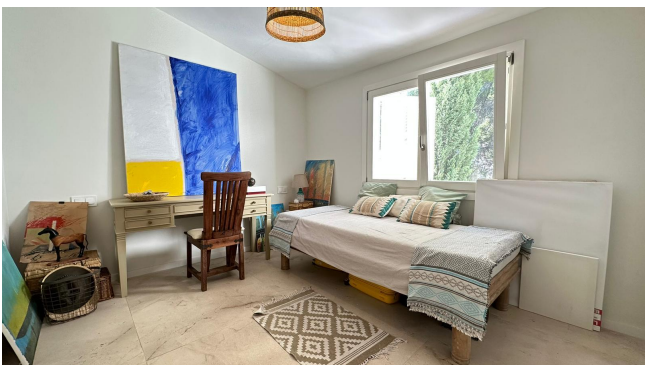
Majorca house for sale