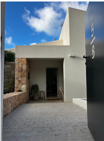
Villa Majorca for sale