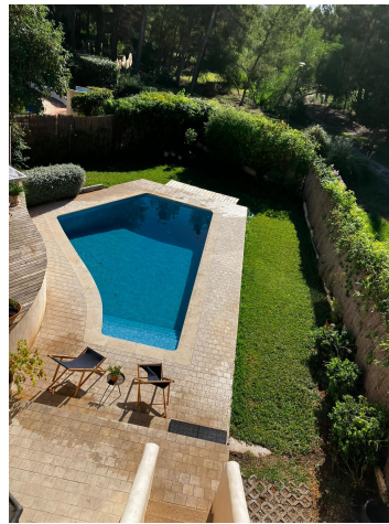
Majorca for sale