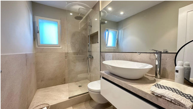
Villa for sale Majorca beach