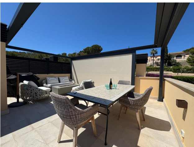
private roof terrace