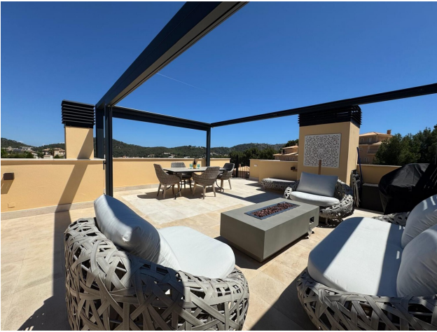
kaufen Penthaus Mallorca