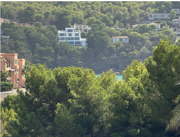
little sea view from the roof