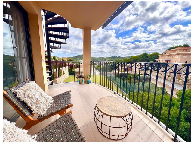
Terrasse mit tollem Weitblick