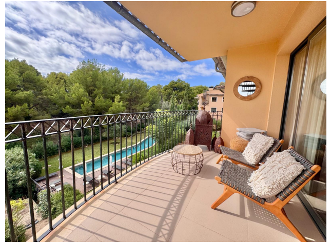
Camp de Mar Penthaus