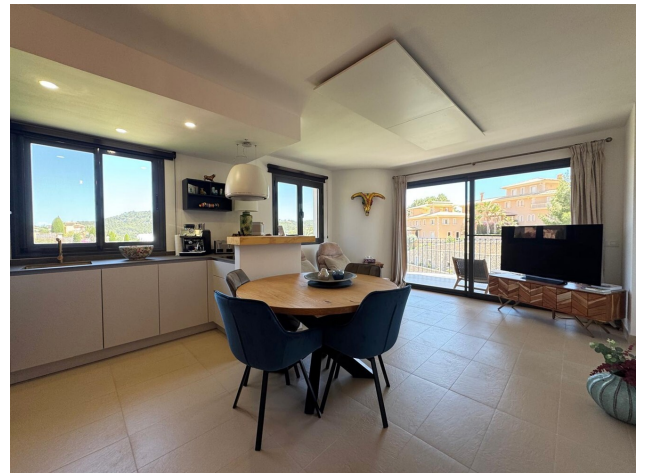
Penthouse kaufen Camp de Mar