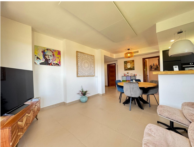
Penthouse for sale