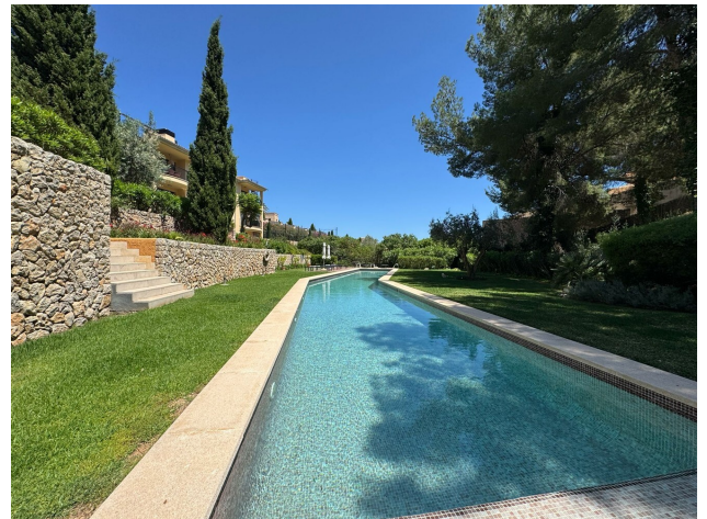
Communkity pool 50 m