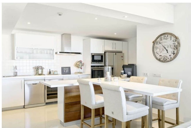
Penthaus Sol de Mallorca