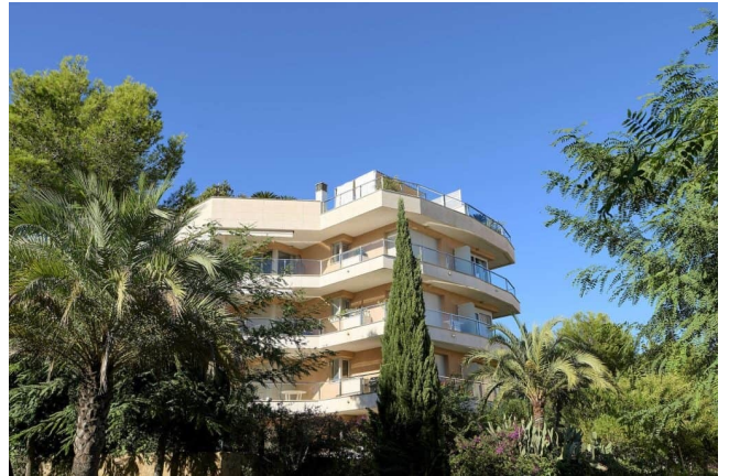
penthouse for sale