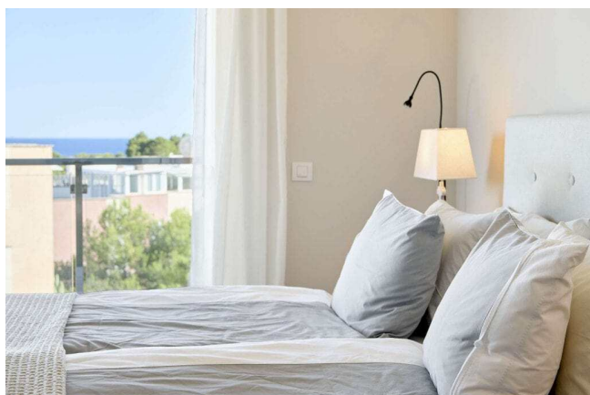
for sale penthouse