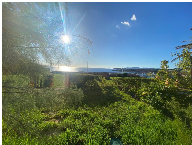
1. Linie kaufen