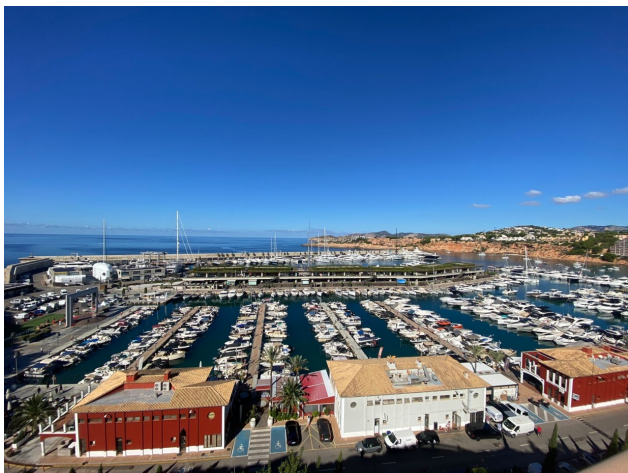
1. Linie Reihenhause