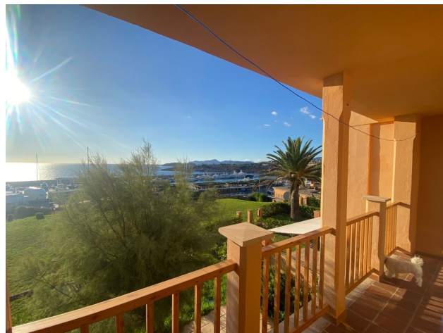
kaufen Port Adriano