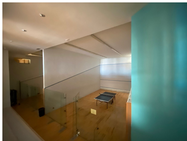
Mallorca Haus 1. Linie