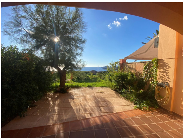
Haus mit Meerblick