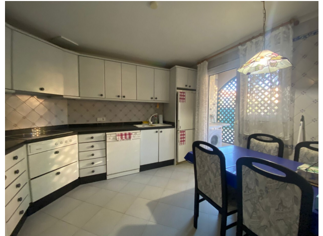
Reihenhaus kaufen 1. Linie