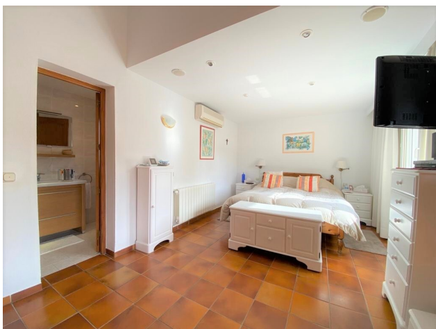
kaufen Mallorca Haus