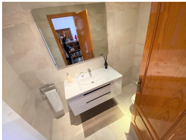
kaufen Haus Mallorca