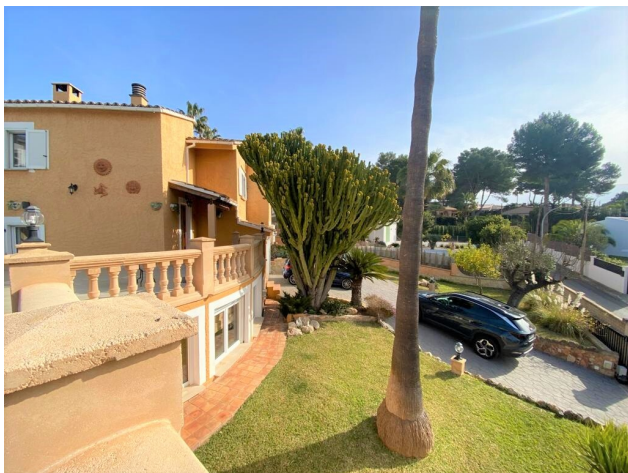
kaufen Haus Costa de la Calma