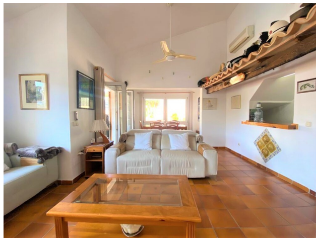
kaufen Immobilie Mallorca