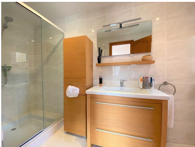
Villa zu verkaufen