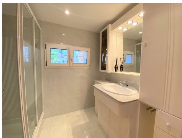
Villa kaufen Mallorca