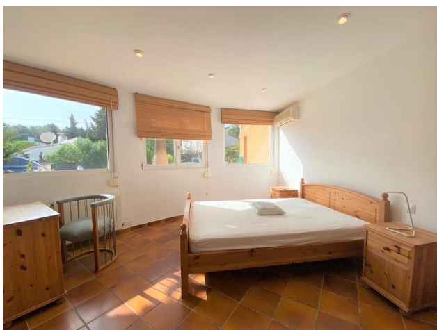
Kaufen Villa Pool