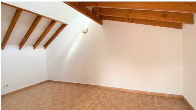
for sale Sol de Mallorca