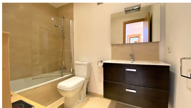
Mallorca Immobilien kaufen