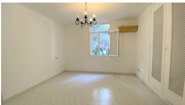
Reihenhaus kaufen Mallorca