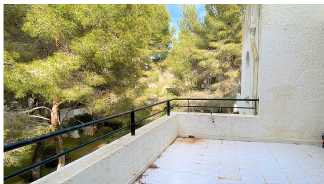
Mallorca for sale house