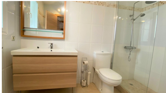
kaufen Sol de Mallorca