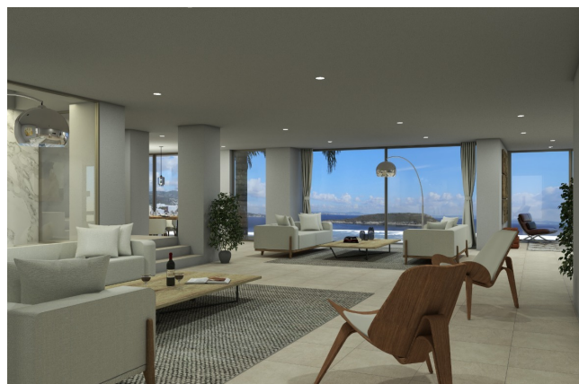
Villa 1. Linie