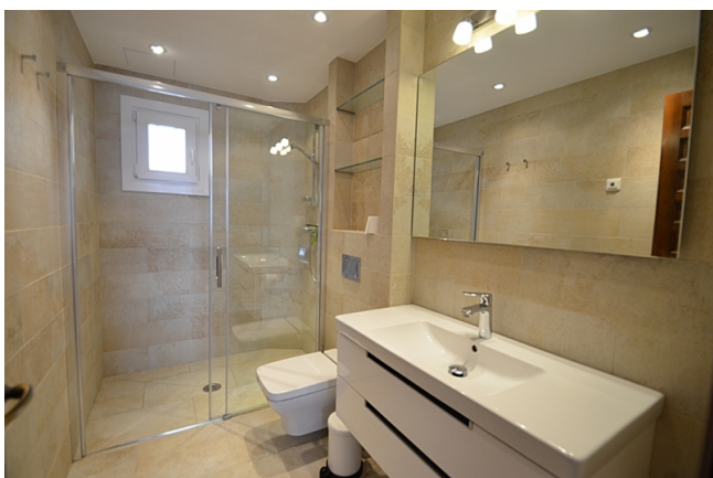
Cala Fornells kaufen