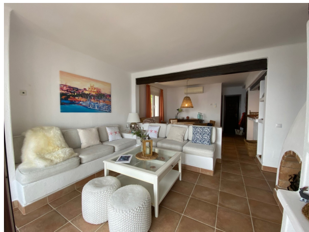
1. Linie kaufen