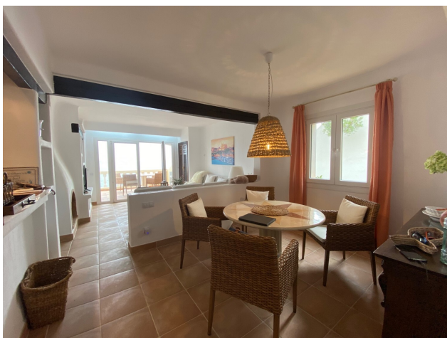
Meerblick Cala Fornells