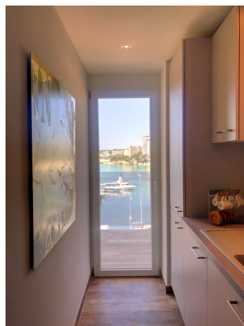
Meerblick Penthaus Wohnung