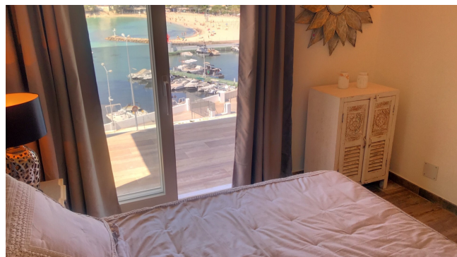
1. Linie Mallorca