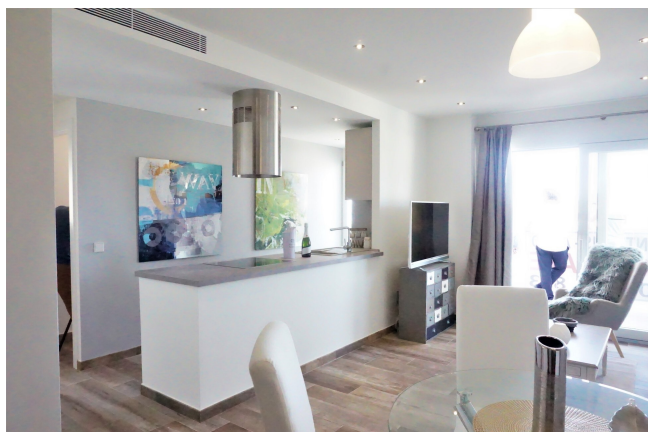
1. Linie Meerblick