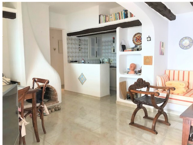
Mallorca Cala Fornells