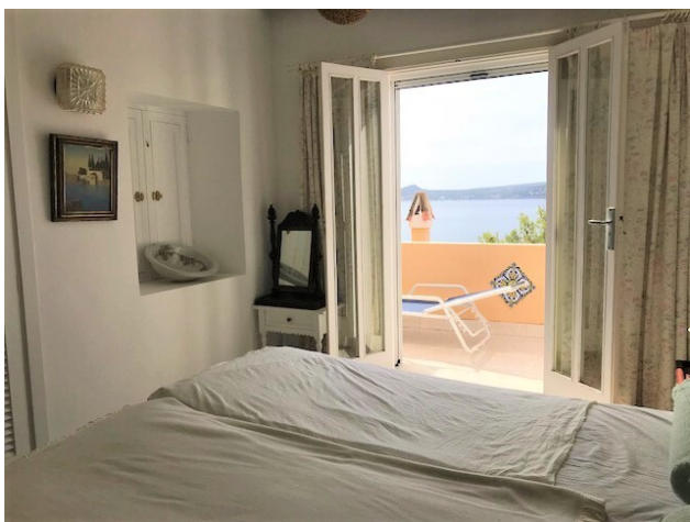
kaufen Cala Fornells