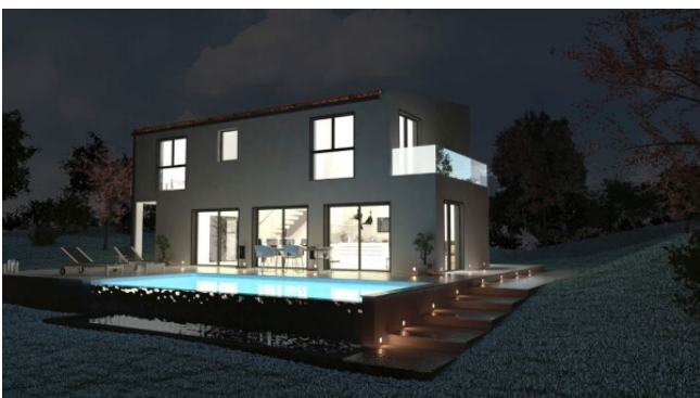
Bauen El Toro