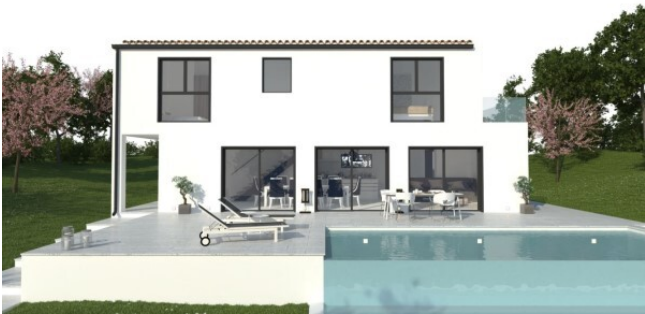
bauen auf Mallorca