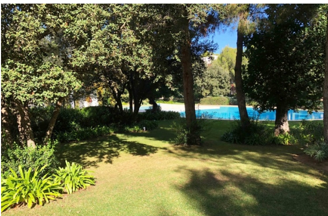
Wohnung mit Gemeinschaftspool