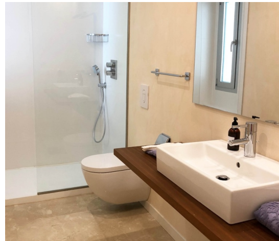
Wohnung in Anlage mieten