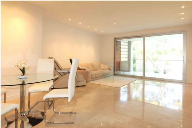
Moderne Wohnung in Bendinat mieten