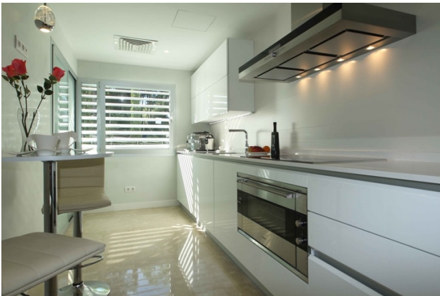
Immobilie mieten auf Mallorca