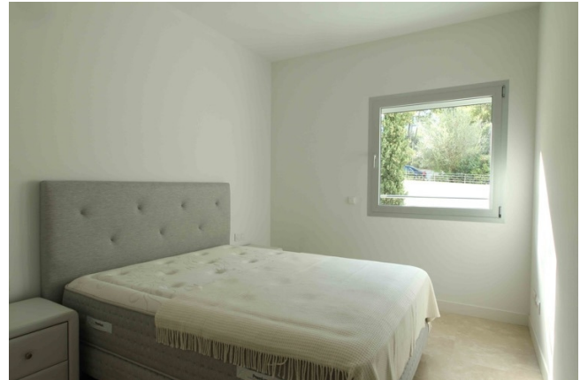
Mieten in Bendinat