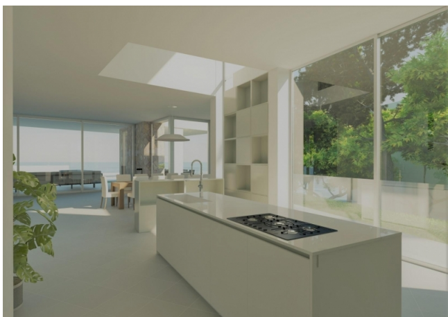
Villa 1.Linie mit freiem blick aufüs Meer kaufen