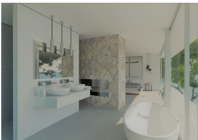
Stilvolle Villa mit Meerblick kaufen