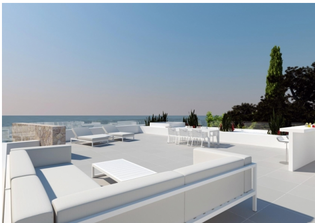
Luxus Villa 1. Line über Felsenküste