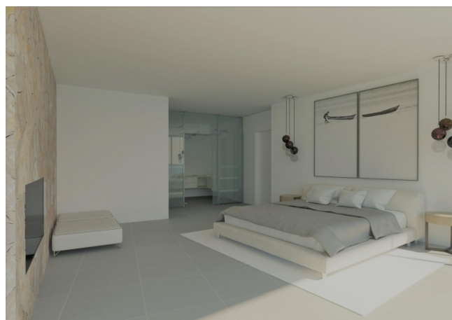
Atemberaubende Villa in El Toro kaufen