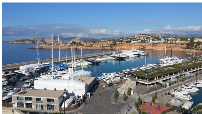
Blick Schlafzimmer- Bad