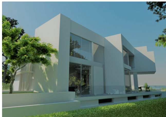
Fantastische Villa kaufen in El Toro