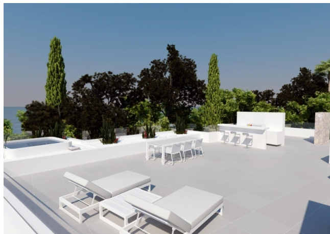
Villa mit Meerblick