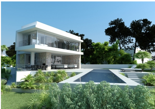
Kaufen in El Toro Villa