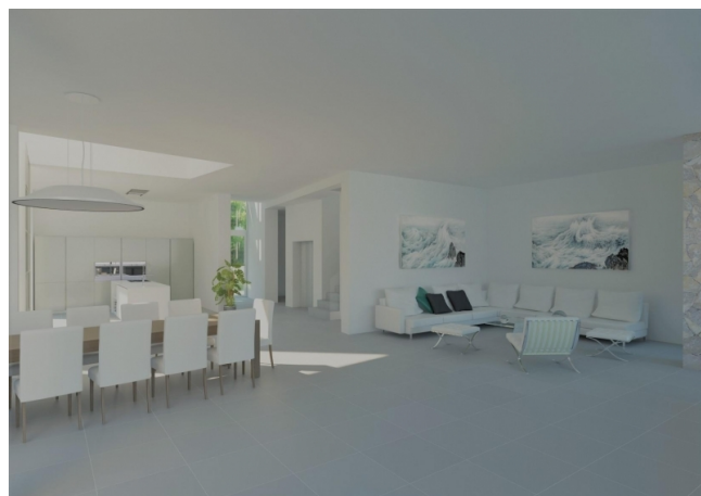
Moderne Villa 1. Linie kaufen