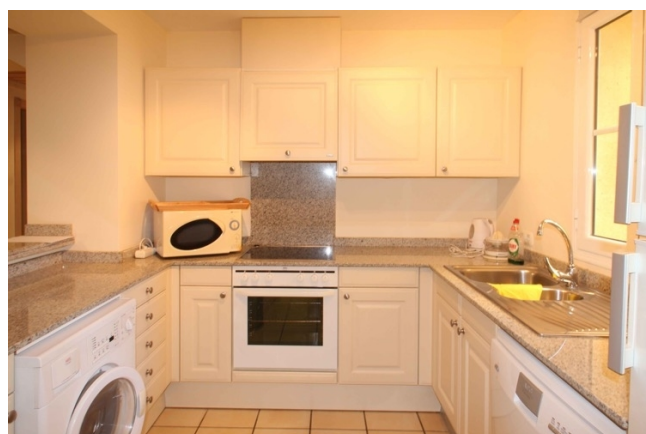
Mieten im Südwesten