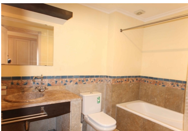
Wohnung in Wohnanlage mieten