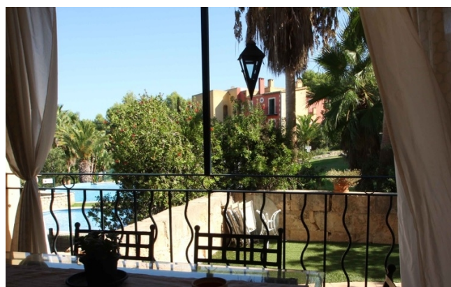
Mieten in Santa Ponsa