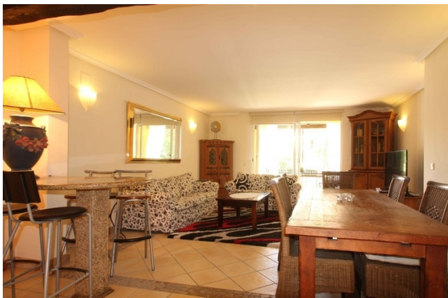
Gartenwohnung zur Miete in Santa Ponsa