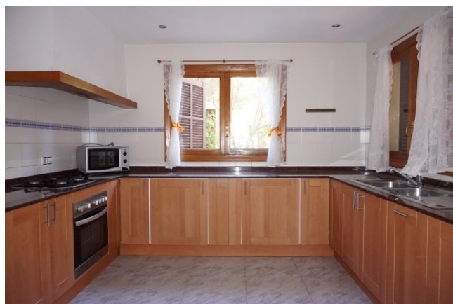
El Toro Chalet kaufen