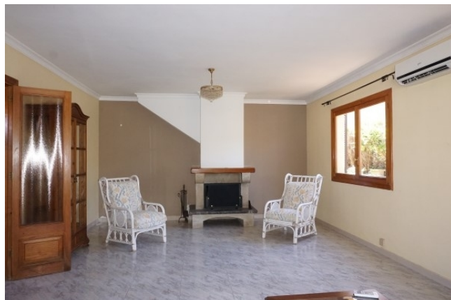
Chalet El Toro