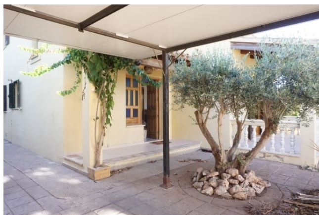
Chalet in El Toro