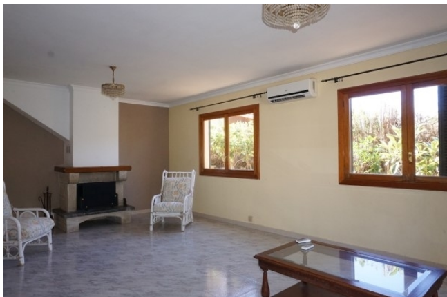
Haus Kauf El Toro