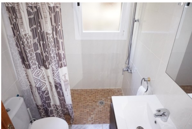
Chalet El Toro