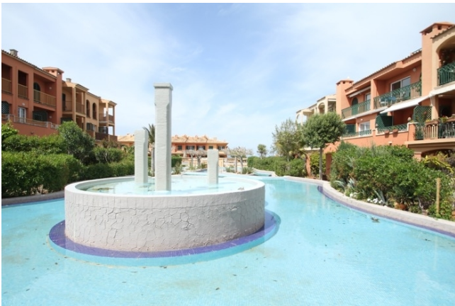
Duplex Wohnung kaufen