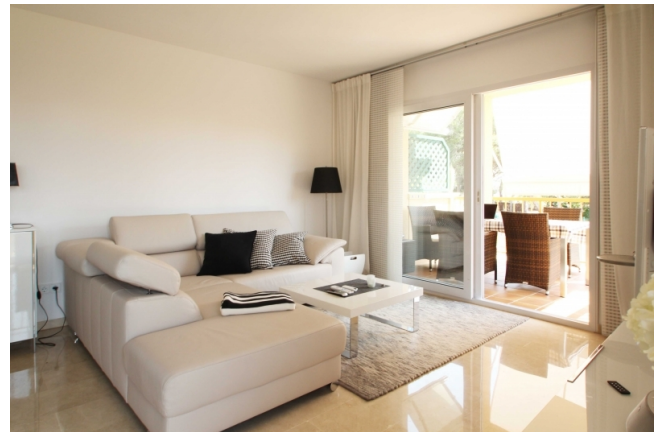
Duplex Eck Penthouse