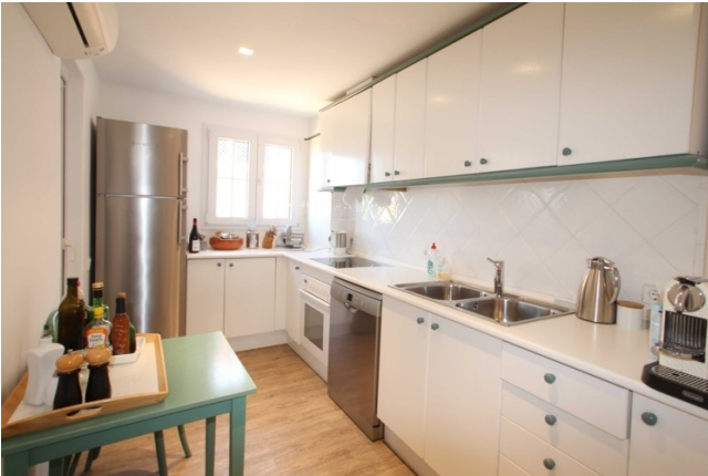
Kaufen in El Toro