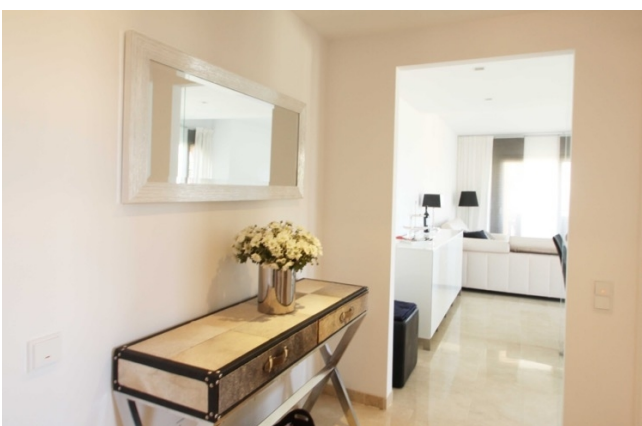
El Toro Penthouse