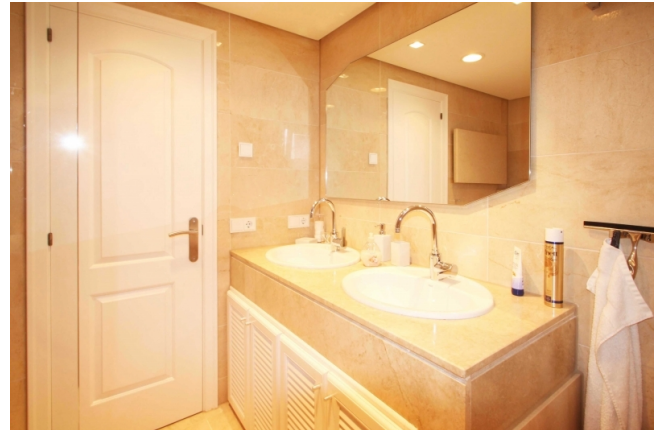
Wunderschönes Atico El Toro