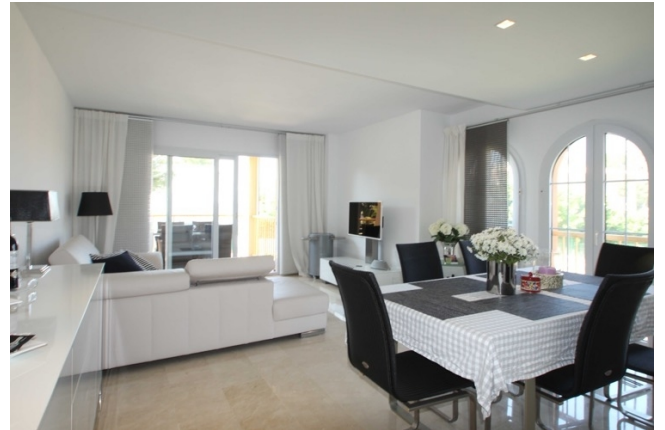
Schönes Penthouse El Toro