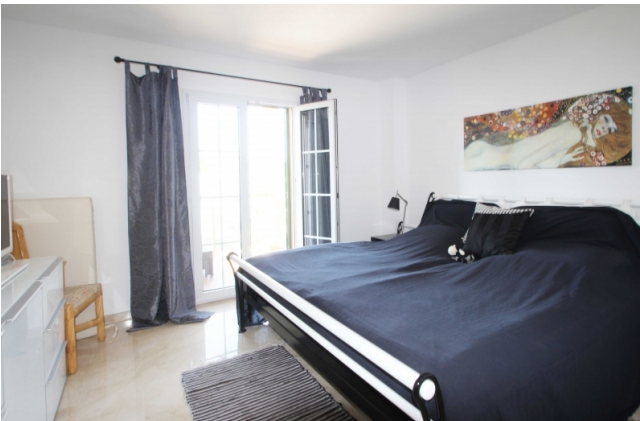
Penthouse mit Meerblick El Toro