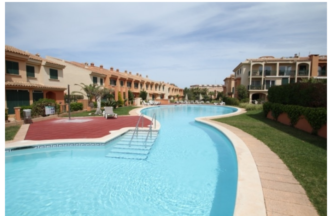
Pool in Wohnanlage El Toro