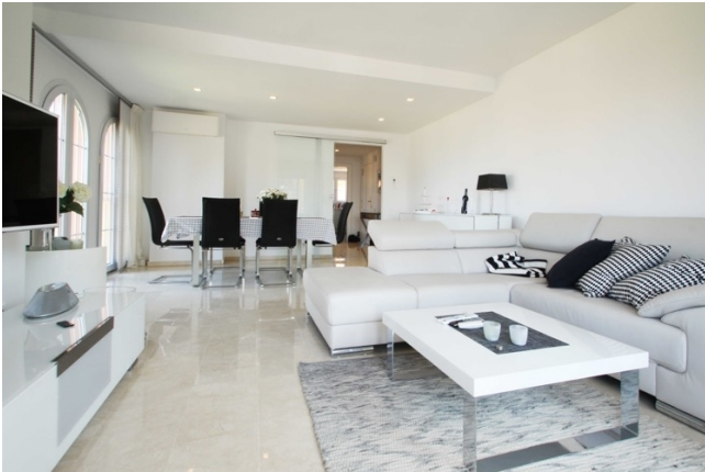
Duplex Penthouse El Toro