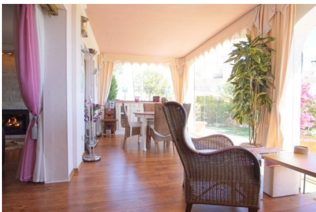
Veranda mit Blick links