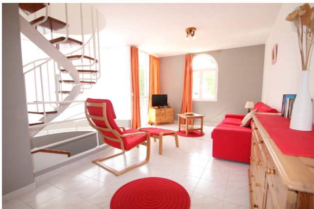
Duplex in Sol De Mallorca