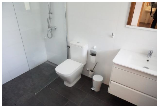
Sol de Mallorca