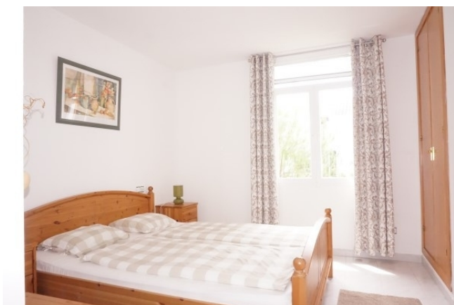
Sol de Mallorca Bad