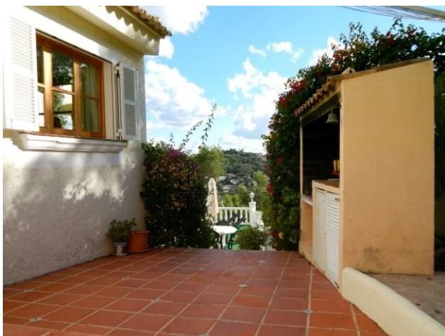
Haus in Anlage