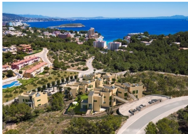
8 Lage zum Strand