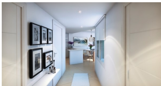
6a Flur Neubau