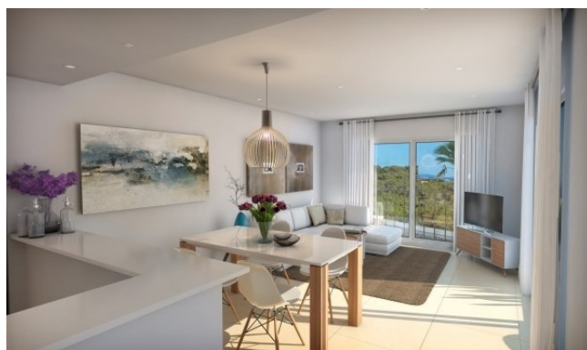
5 Wohnbereich Neubau