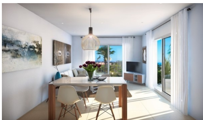
6 Essbereich Neubau