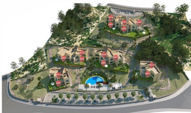
7 Lage Apartments