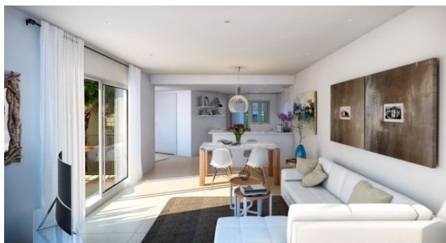
4 Wohnbereich Neubau