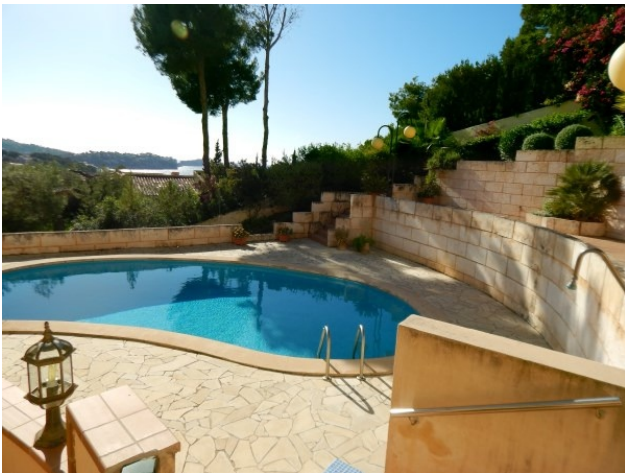
Doppelhaushälfte mit Pool kaufen