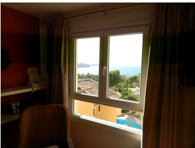
buy semi-detached house