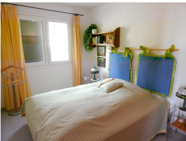
Costa de la Calma