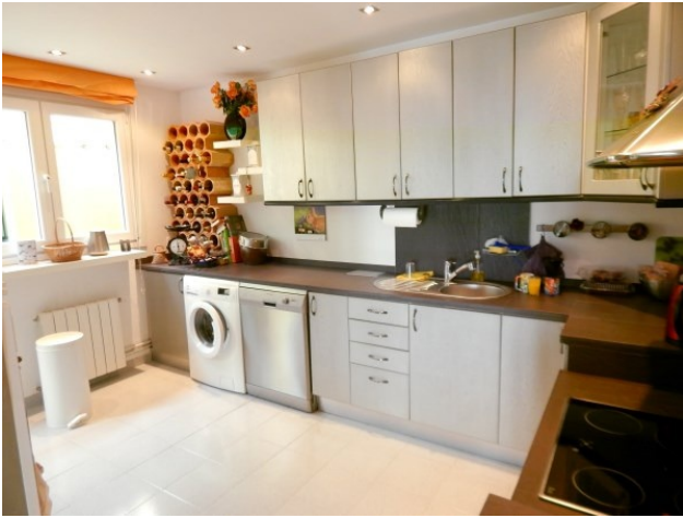
Real Estate Mallorca