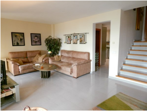
Costa de la Calma Haus kaufen