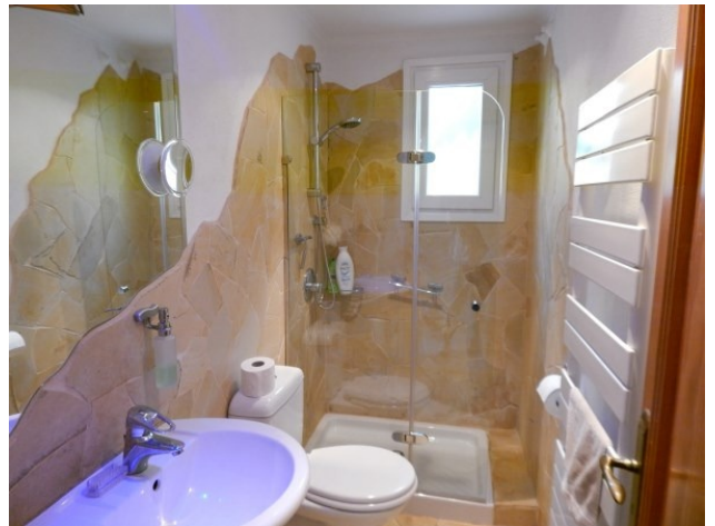
Kaufen in Coasta de la Calma