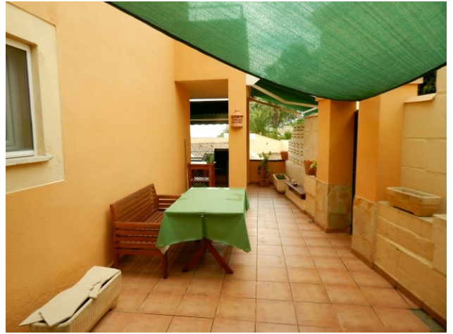
Casa en Costa de la Calma