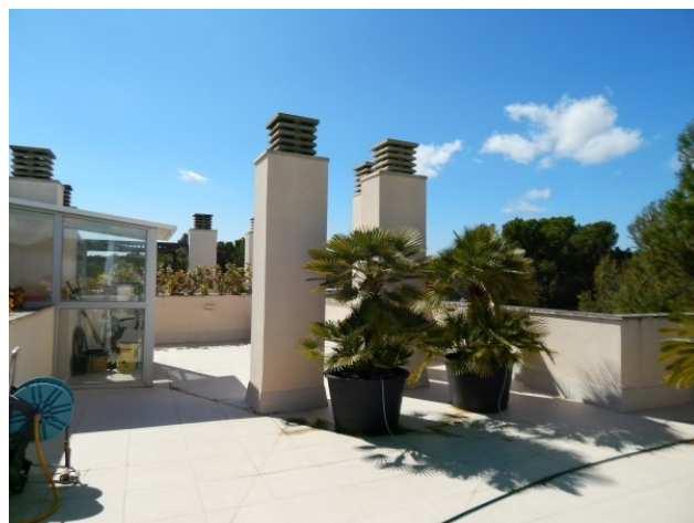
kauf Penthaus Mallorca