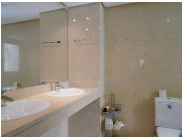
kaufen Sol de Mallorca