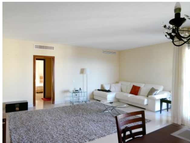
zu verkaufen Penthaus