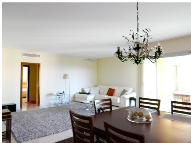
Penthaus 4 Schlafzimmer