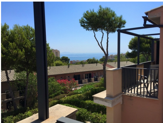
House for sale in cala Vinyas-views first floor