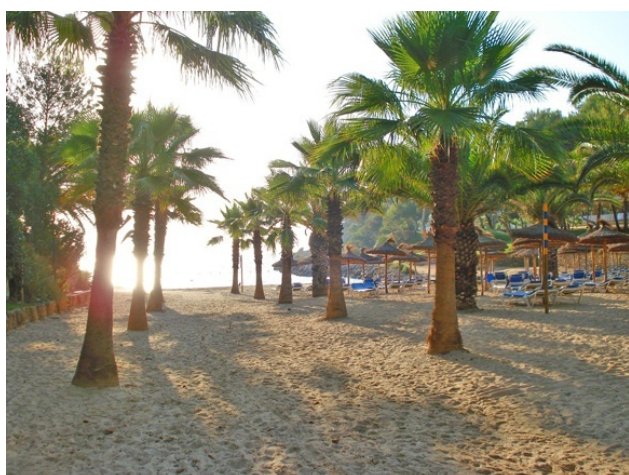
Strand Cala Vinyas-Beach of Cala Vinyas