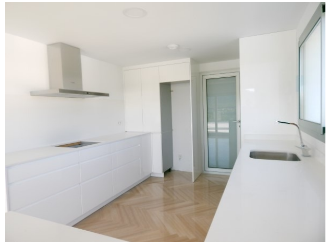
5 Penthouse Santa Ponsa