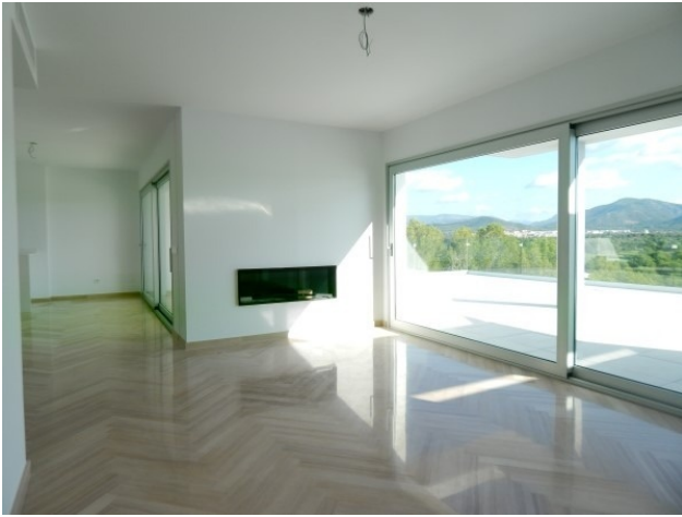
2 Penthaus Santa Ponsa