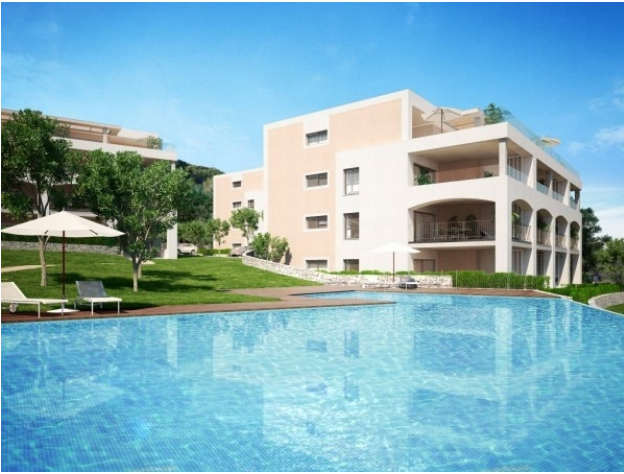
Pool Santa Ponsa