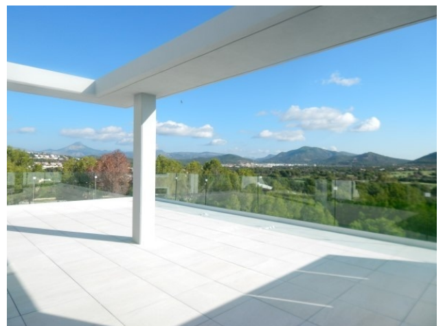
7 Penthouse Santa Ponsa