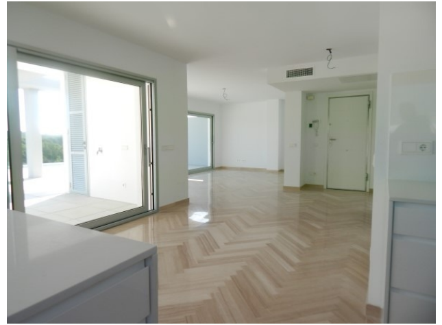
3 Penthouse Santa Ponsa