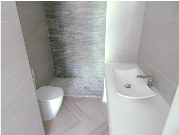
4 Penthaus Santa Ponsa