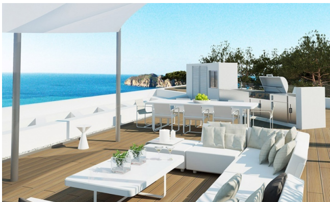
Meerblick Villa Neubau Santa Ponsa