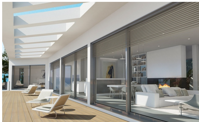
Minimalistische Neubau Villa mit Meerblick