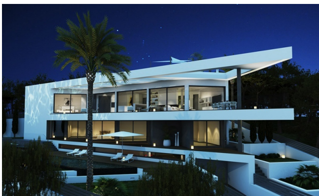
Neu Villa Nova Santa Ponsa mit Meerblick