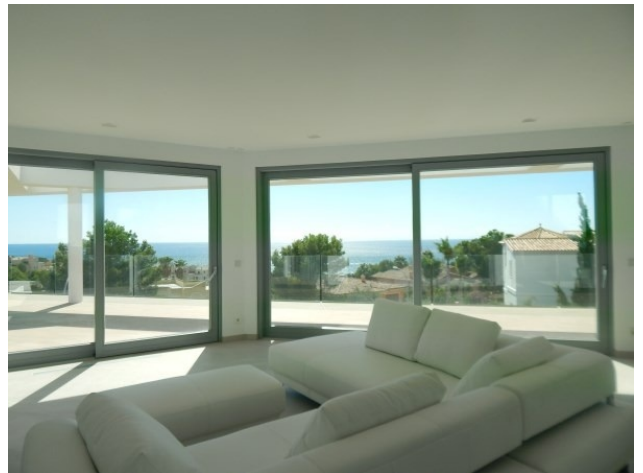
Villa Terrasse Meerblick