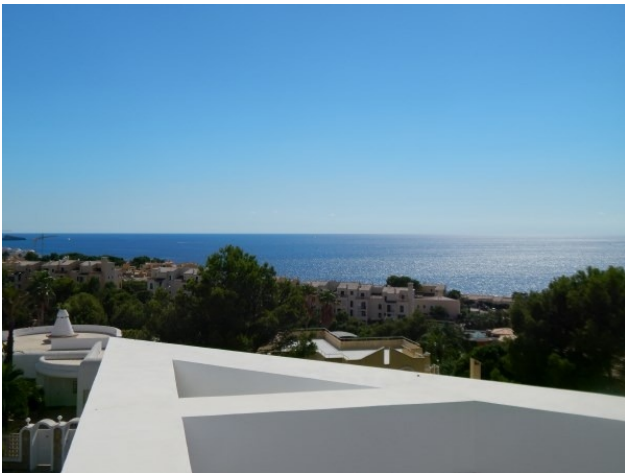
Villa Meerblick Santa Ponsa Nova