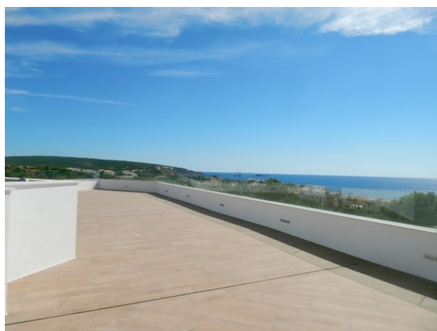
Dachterasse Maarblick Villa