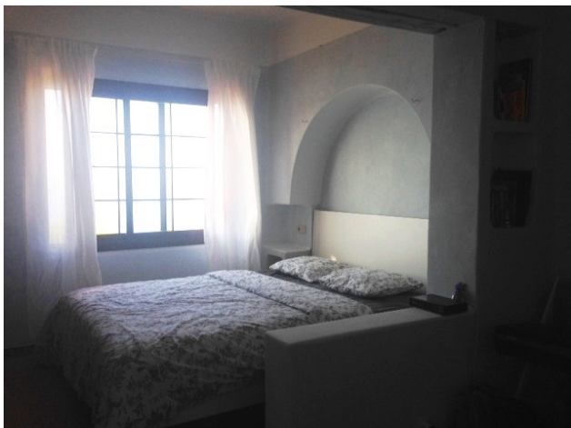
Schlafbereich Cala Fornells