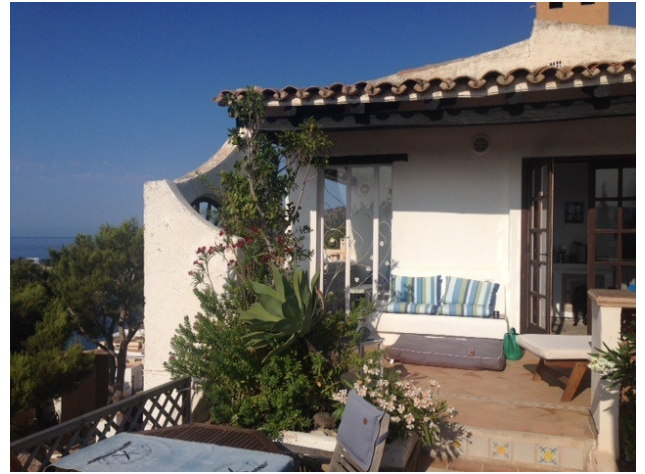
Terr Cala Fornells