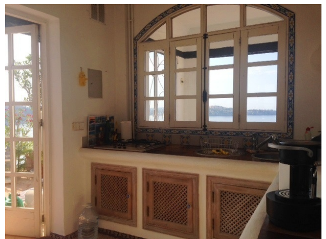
Küche Cala Fornells