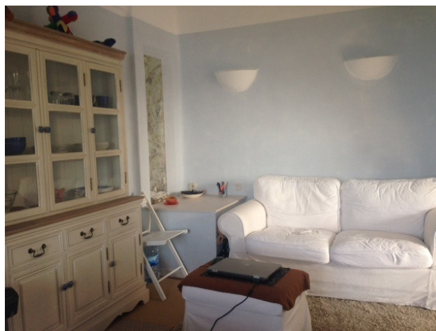
Wohn und Schlafbereich