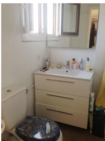
Bad Cala Fornells