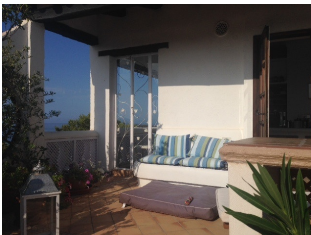
Terrasse Cala Fornells