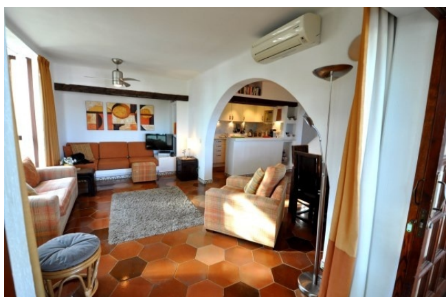
3 Cala Fornells