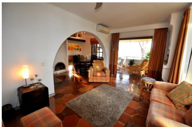
2 Cala Fornells